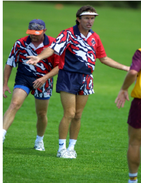
"Who me?" I never claimed a touch