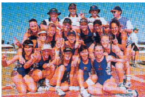
Last year's runners-up, the Sydney Mets, go one better with a strong win over the Gold Coast Sharks to take the Women's Open title.