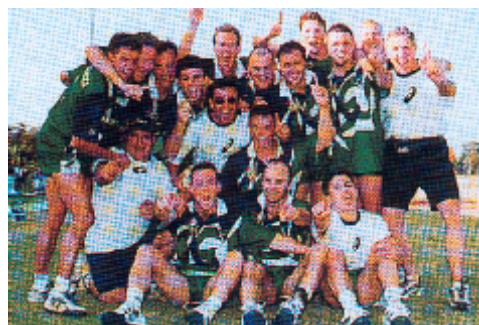
Sydney Scorpions celebrate back-to-back Men’s Open NTL titles.