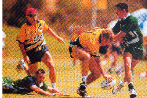
A vastly improved Crusaders side pushed the eventual winners, the Sydney Scorpions, to the limit in a narrow pool loss.