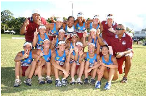
The Champion Sharks Womens team