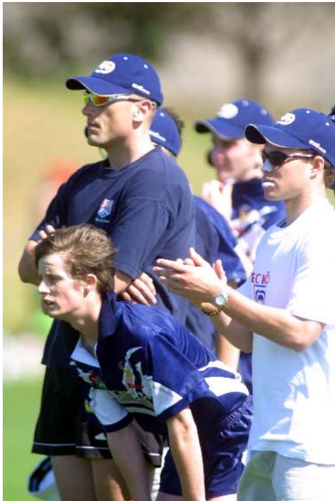
The Mets boys not enjoying their final.