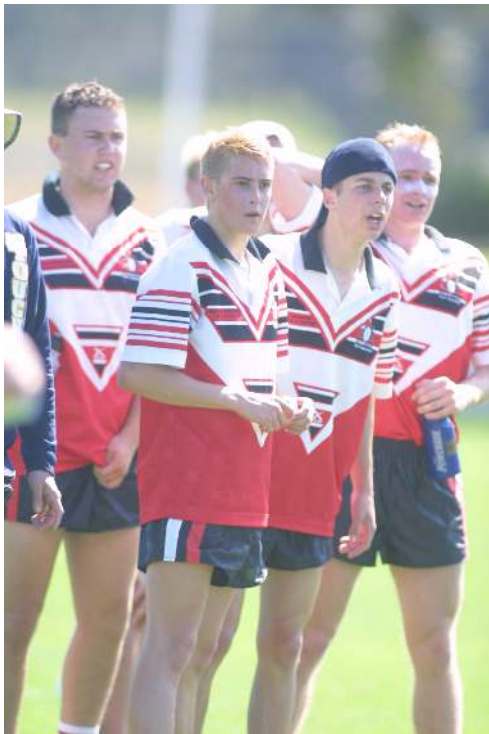
An anxious group of North Canberra Boys 18's awaiting the referees decision on a Touchdown