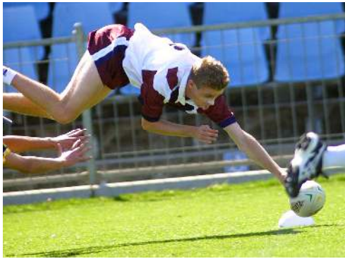
Despite this spectacular Touchdown by QSST they failed to defeat the Mets