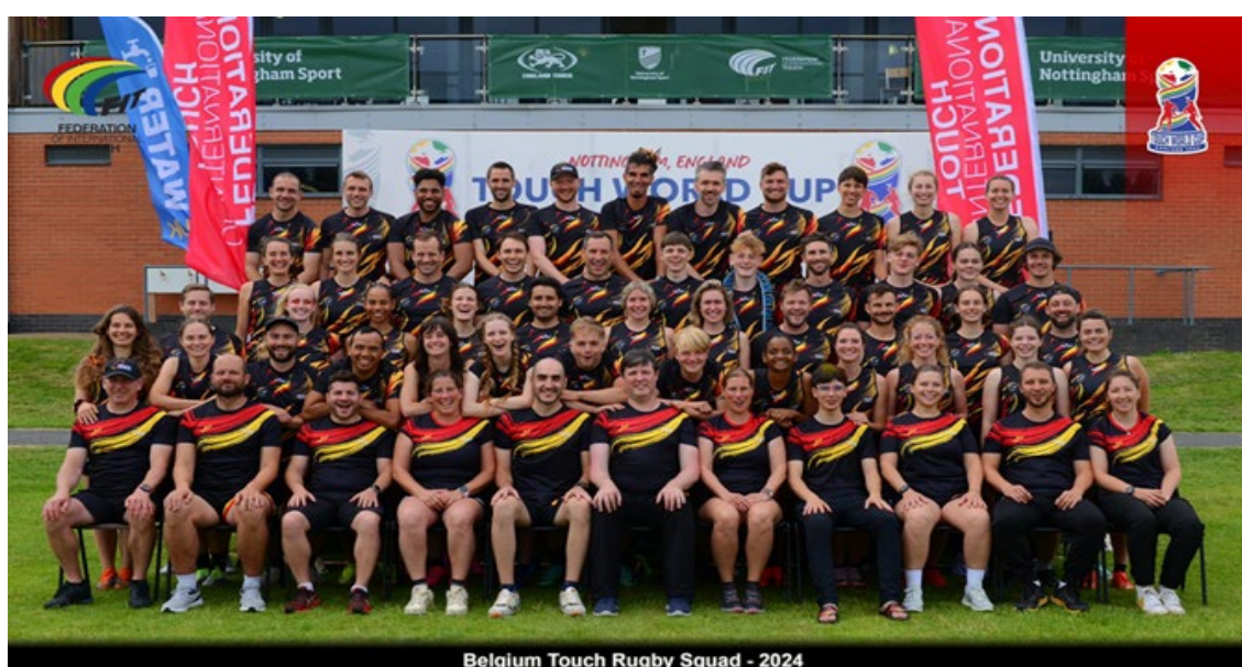
Belgium Touch Rugby Squad - 2024